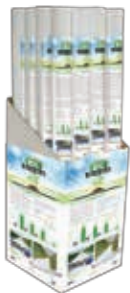
40" X 47" Display (16 Roll)

Growfloor™ comes in a variety of sizes to fit any need, 40"X47" mat, 5'X10' roll, 7.5'X15' roll, and 10'X61' roll. Growfloor also comes in a variety of product displays for distributors or retailers. Please visit us online at www.mygrowfloor.com to place an order or contact customer service if you have any questions.