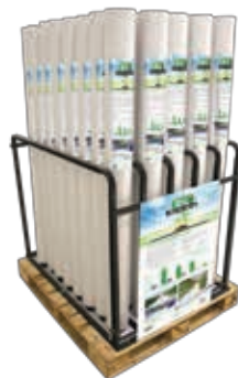
5' X 10' Display (40 Roll)