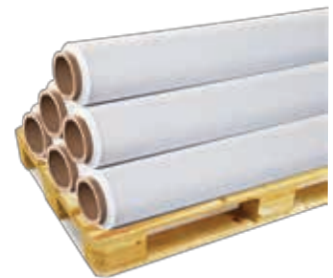
10' X 61' Pallet (6 Roll)