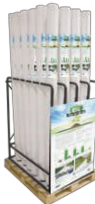
7.5' X 15' Display (24 Roll)